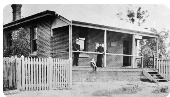
16. Glen Forrest Post Office, 50 McGlew Rd. Built 1901.

Built on land donated by W H McGlew, it served the area until 1960, when a new hall was built in Marnie Road. Then used by the CWA and since the 1980s by the Eastern Hills Wildflower Society.