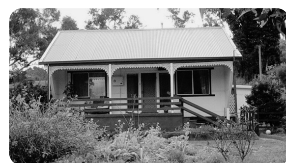
21. Railway Ganger's House, 21 Railway Pde. Photo 2006.

Station Master, M J Morgan was instrumental in starting the bowling club. Constructed by community labour, the greens were opened for use in 1932.