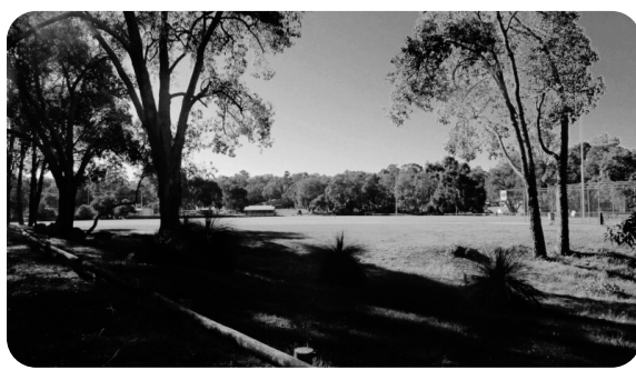
19. The Recreation Reserve, Marnie Rd to Braxan St. Photo 2020.

Braxan street was named after the three sons of the Wheeler family when they moved into the unnamed road in the 1950's. 'Brian', 'Max' and 'Ian' were shortened and combined to create this name.