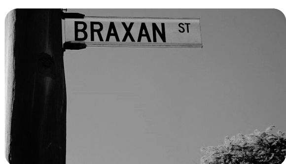
18. Origin of Braxan Street Name.