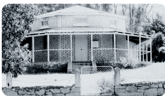
15. Forrester Hall/Octagonal Hall, 52 McGlew Rd. Photo Campbell Cornish 1974.

Built and consecrated in 1905 as a Baptist church, it then became a Methodist church in 1925. Finally in 1979 it was amalgamated into the Uniting Church.