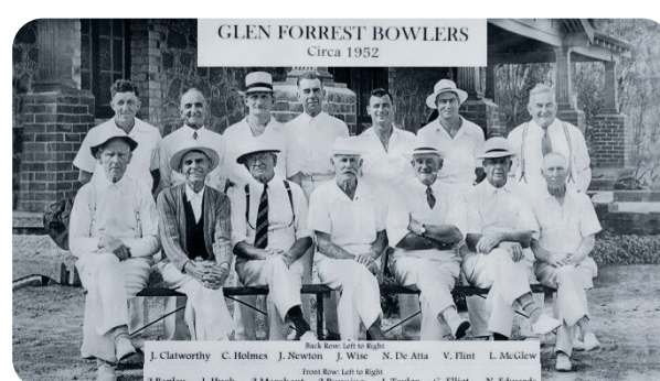
20. Glen Forrest Sports Club, cnr Marnie and McGlew Rds - est 1930.