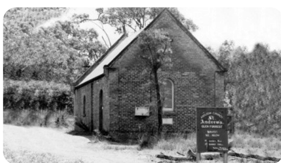
17. St Andrews Church, 38 McGlew Rd. Built 1903.