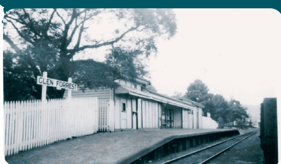
11. Smiths Mill/Glen Forrest Railway Station, Railway Pde. Built in 1884.

This was home to 11 of the 14 station masters until the line closed in 1954. It was then sold to the Tomczak family, who lived there from 1956 - 1994. The Shire now owns the property & community groups use it.