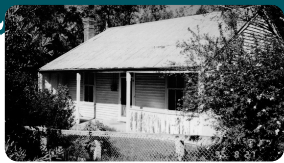
10. Station Master's House, 2 Railway Pde. Built in 1898. Photo B Callow 1995.

This was home to 11 of the 14 station masters until the line closed in 1954. It was then sold to the Tomczak family, who lived there from 1956 - 1994. The Shire now owns the property & community groups use it.