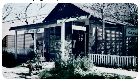
12. Gift Shop, 9 Railway Pde.

The Eastern Railway ran from Guildford to Chidlow's Well. This yard had spurlines and loading ramps for loading timber, gravel, bricks, fruit and grapes.