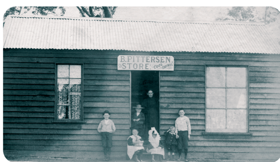
13. Pittersen's Store, 3 Railway Pde.