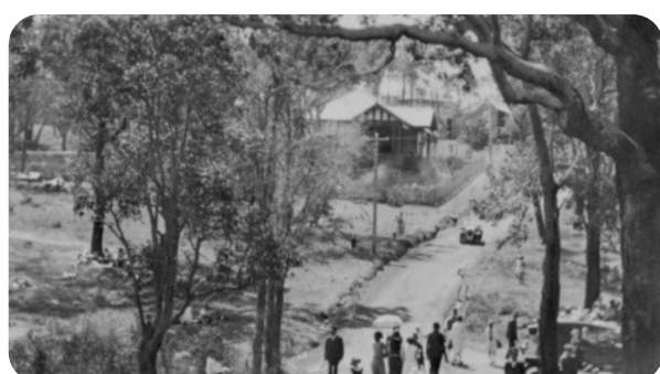
15. Grevillea Tearoom, Boarding House and Chemist (1926) 356 Glen Rd.