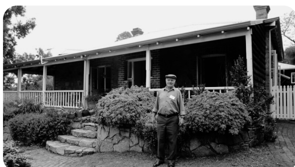
18. 'Meedo' (1920) 16 Beenong Rd.