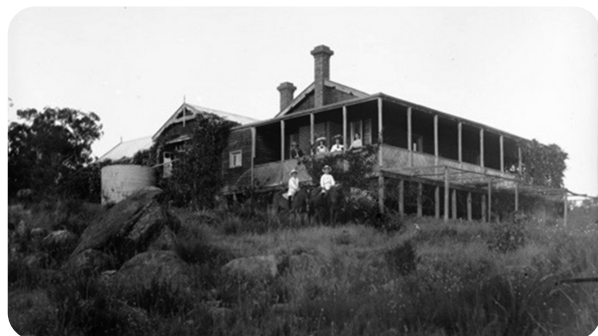
17. Site of old 'Bellair' homestead (1897) 160 Victor Rd.