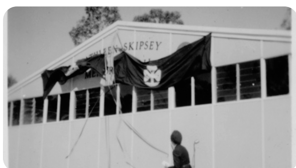
16. Kathleen Skipsey Memorial Hall built in 1957 and commemorated in 1959. Glen Rd.

The first classroom was built in 1913, this was demolished along with the 1916 & 1924 rooms. Left is the last classroom built in 1956 along with the original boys shelter shed in 1924. In 1963 the school was rebuilt.