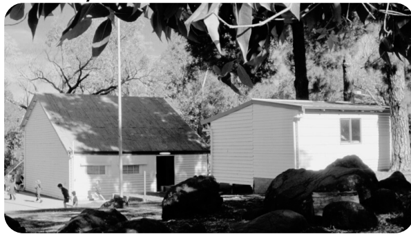
14. Darlington Primary School (1913) Amherst Ave.