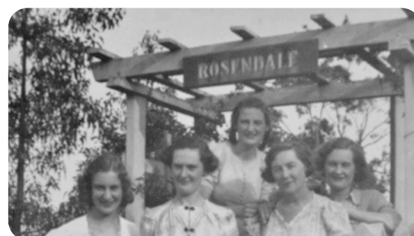
21. Rosendale Guest House (1936) 11 Owen Rd.