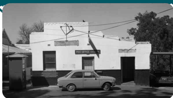
11. Darlington Post Office (1937) 18 Brook Rd.