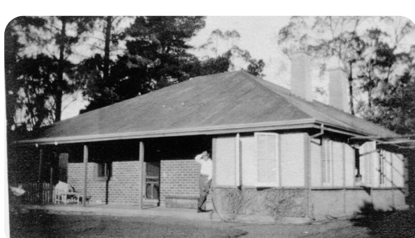
20. The Vineyard Managers House (1889) 5 Owen Rd.