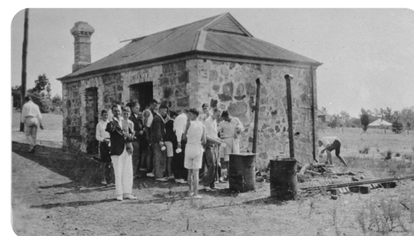
22. Still Room (1896) Owen Rd.