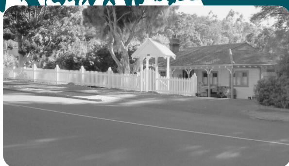
12. Station-Master's House (1921) 155 Glen Rd.

Lance Holt School was an independent school set up in 1974. It later changed to Beenong then Montessori Treetops in 1989. It has expanded over several properties now teaching from K-Yr 12.